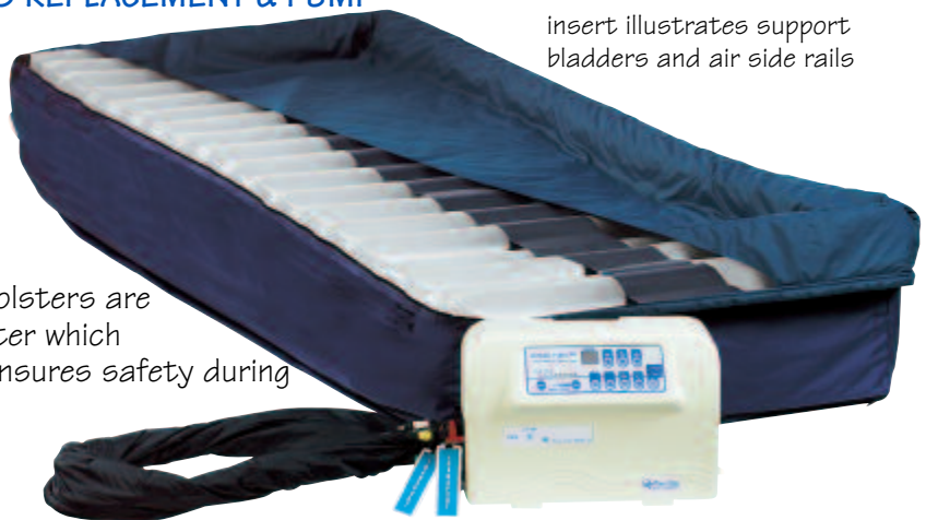
insert illustrates support bladders and air side rails

Mattress Cover: Vyvex-III® - Urethane coated, multi-stretch, low shear, moisture vapor permeable, quilted, removable, zippered cover, is anti-microbial and meets Cal. Tech. #117 for fire-retardancy.